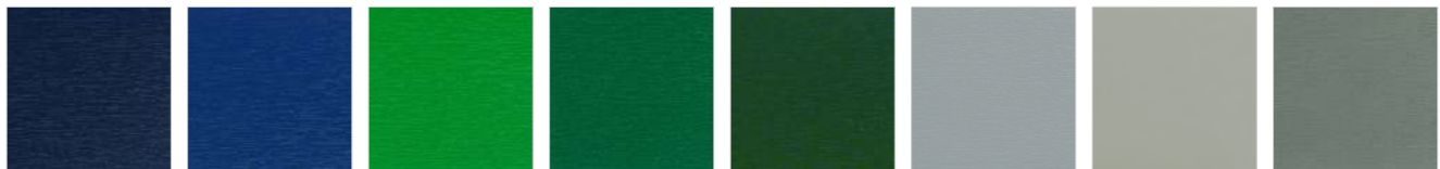
RAL 5011 S Stahlblau RAL 5013 S Kobaltblau RAL 6001 S Hellgrün RAL 6005 S Moosgrün RAL 6009 S Tannengrün RAL 7001 S G Silbergrau RAL 7004 G Signalgrau RAL 7012 S G Basaltgrau