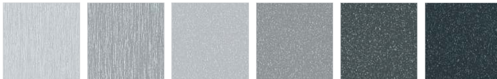
Aluminium gebürstet Metallic Silber Alux weißaluminium Alux graualuminium Alux DB 703 Alux anthrazit