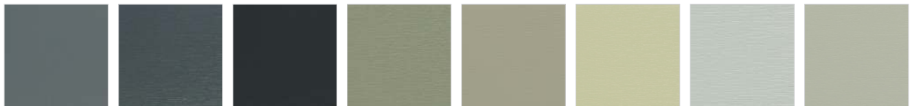
RAL 7015 G Schiefergrau RAL 7016 S G Anthrazitgrau RAL 7021 G Schwarzgrau RAL 7023 S Betongrau RAL 7030 S Steingrau RAL 7032 S Kieselgrau RAL 7035 S G Lichtgrau RAL 7038 S G Achatgrau