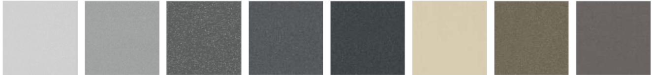
Mattex Shine white aluminium Mattex Shine grey aluminium Mattex DB 703 Mattex Shine dark graphite Mattex Jet black Mattex Shine beige Mattex Shine deep bronze Mattex Umbragrau