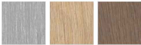
Sheffield Oak concrete Turner Oak malt Turner Oak toffee