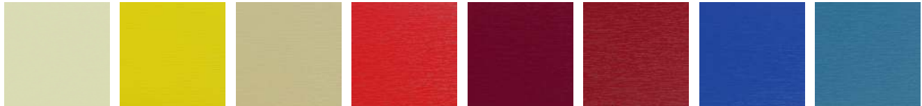
RAL 1015 S Hellelfenbein RAL 1018 S Gelb RAL 1019 S Graubeige RAL 3002 S Hellrot RAL 3005 S Weinrot RAL 3011 S Rot RAL 5002 S Ultramarinblau RAL 5007 S Brillantblau