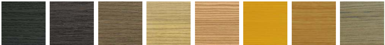
Grey Oak Dark Oak Light Oak Natural Oak Mountain pine Oregon 4 Knotty oak Anteak