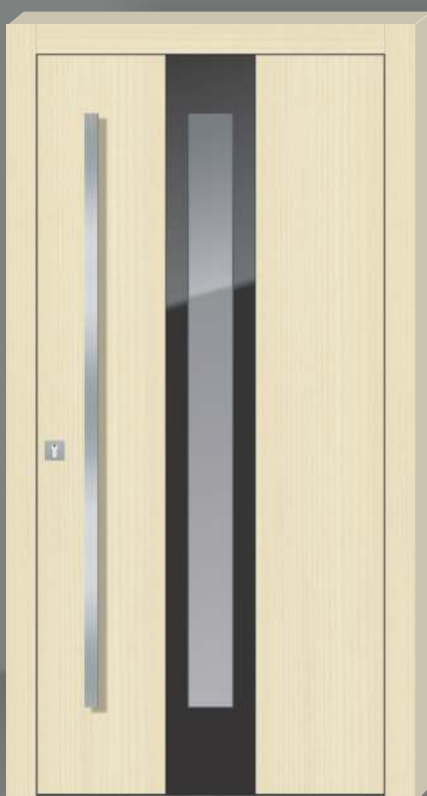
Model HATS / HTS 206

Color and wood spruce fir, RF/K 10 Handle P 3217 Application enamel glass -RAL 9017, 7042