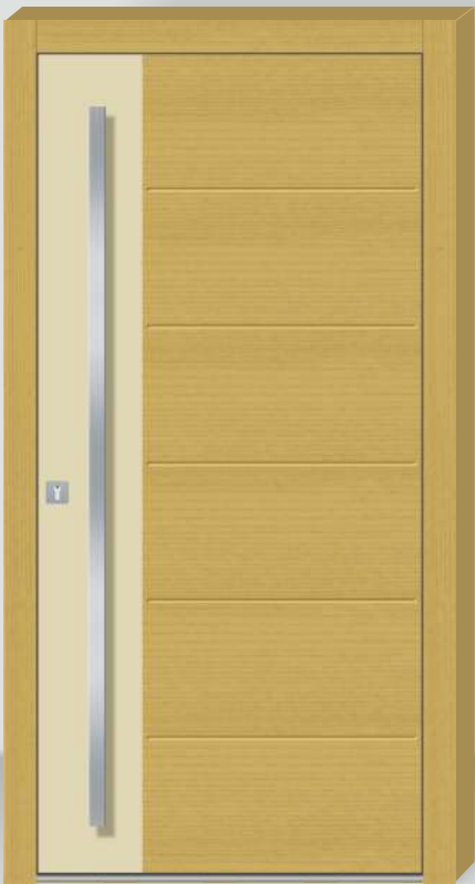
Model HATS / HTS 266B

Color and wood spruce fir, RF/K 22, horizontal veneer, Ral 1013 Handle P 3217