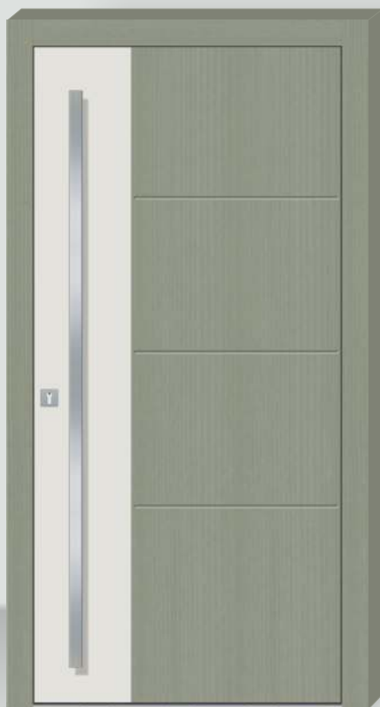
Model HATS / HTS 845

Color and wood spruce fir, RF/K 26 Ral 9002 Handle P 3217