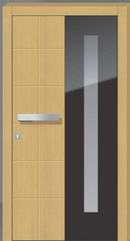
Model HATS / HTS 210