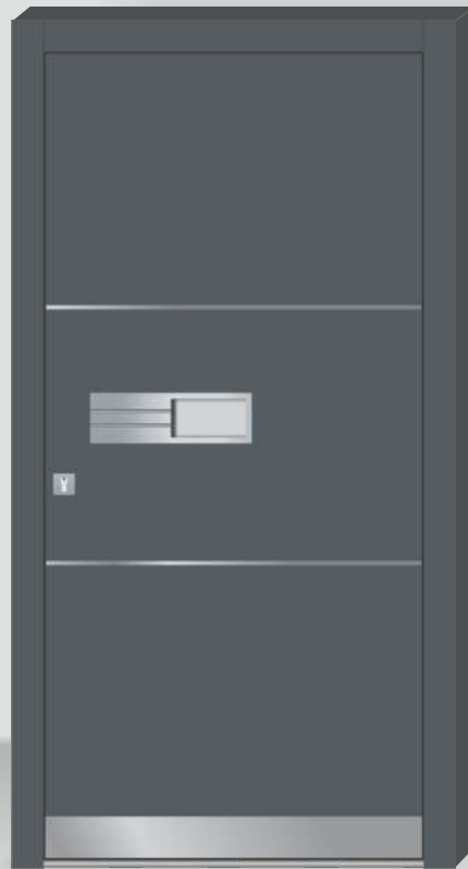
Model HATS / HTS 264