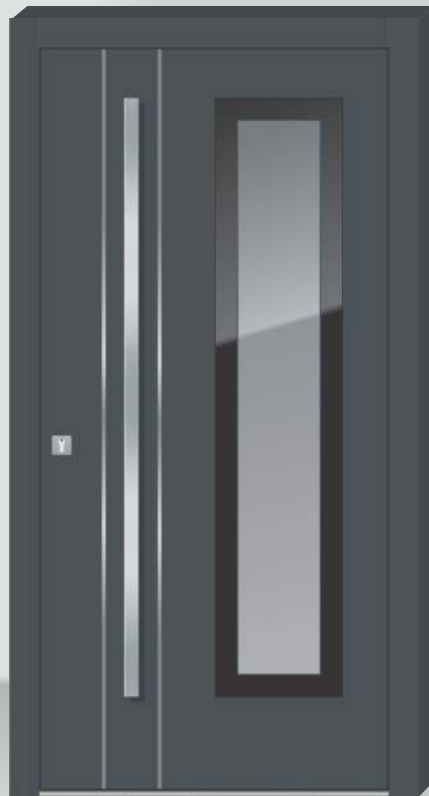
Model HATS / HTS 203