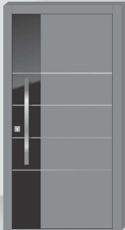
Wood -door model HTS 201

Color Ral 7042 Application enamel glass -RAL 9017, 7042 Stainless steel